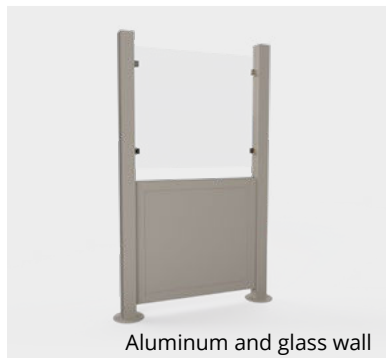
Aluminum and glass wall